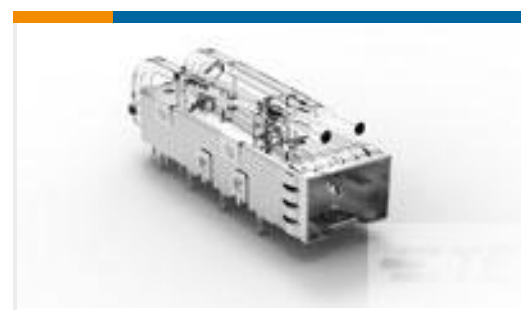
TE Part # 2007254-1 SFP+ 1x1 Cage Assembly, Light Pipe