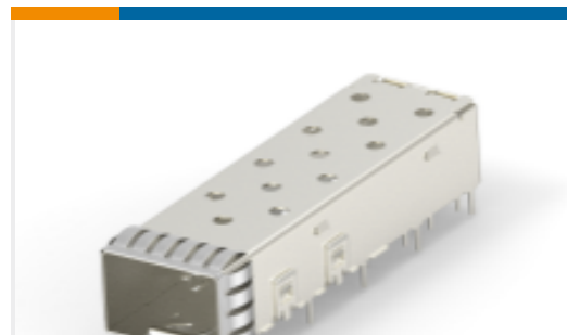
TE Part # 2007194-1 SFP+ 1x1 Cage Assembly, PCI, Solder Tail