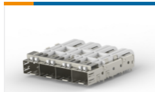
TE Part # 1761008-3 SFP 1X4 CAGE & LIGHT PIPE KIT