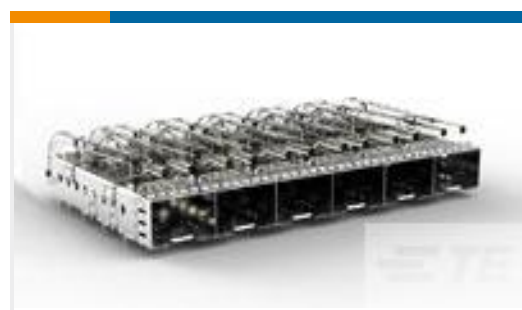
TE Part # 2007250-1 SFP+ 1x6 Cage Assembly with Light Pipes