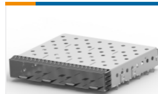
TE Part # 2007178-1 SFP+ 1x4 Cage Assembly, Light