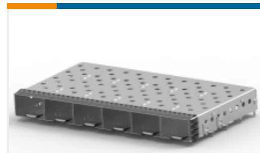
TE Part # 2007251-1 SFP+ 1x6 Cage Assembly