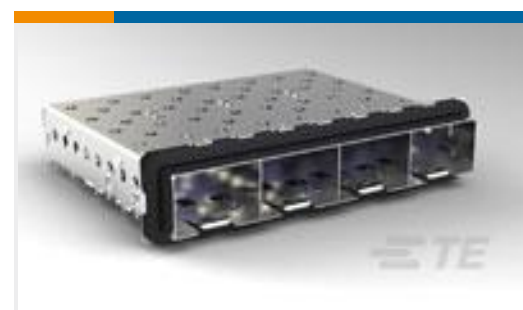
TE Part # 2007135-1 SFP+ 1x4 Cage Assembly w/ EMI gasket